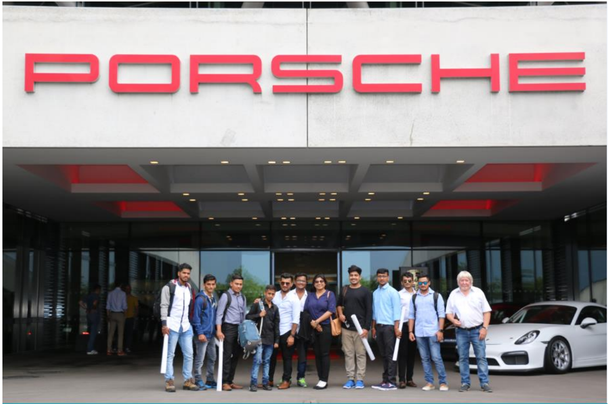
(Group photo Porsche)