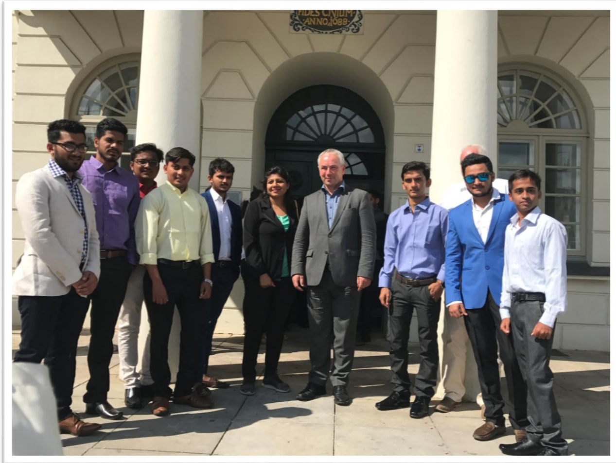
(Mayor of Wismar)

During the meeting he told us about Wismar's history city planning and future planning details.