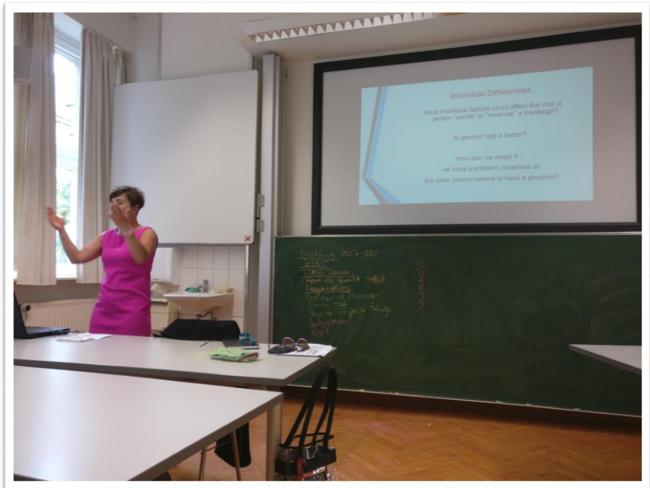
(Classroom of university)